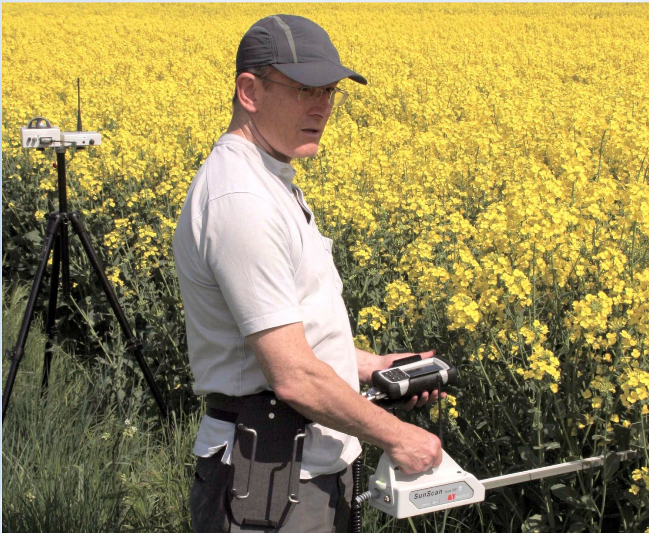
SunScan Probe (radio version) and PDA, with radio-linked BF5 Sunshine Sensor mounted on tripod