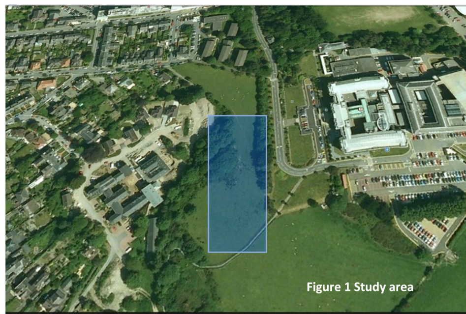
Figure 1 Study area

Field work was carried out within the grounds of the National Library of Wales (co-ordinates 52.41367, -4.07002) defined by the blue box below. (Figure 1)